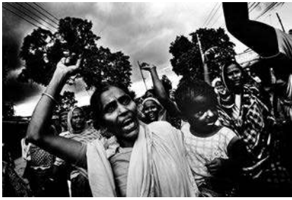
An entire community erupted in protests against a proposed open-cast coal mine project in Phulbari town, in the North-West district of Dinajpur, Bangladesh. Here several dozen women, one with her infant child, are chanting slogans against the proposed coal mine project in 2006.

are now being re-opened to MNCs through the liberalisation of the global economy. The mineral industry's extraction of earth, its use of chemicals, its pollution of waterways and land,