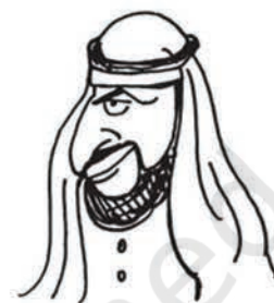
Sheikh Petrodollah King of the land of Black Gold

I value precious things. Bigoil says his President values freedom and democracy. So I keep both safely under lock and key in my land.