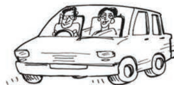
Mr & Mrs Gobbledoo

A new beauty is parked outside our garage. Awesome! Isn't it?...sleek chrome finish, power steering, automatic gears. Excellent pick up and great mileage too. It is low on emissions too...gentle on the atmosphere, you know. Global warming and all that stuff. Now we really are in hurry to zoom off and lead the good life...God Save Everyone!...vrrrooommmmm