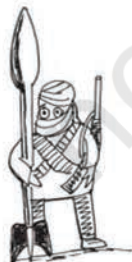
Errorists Loose cannonballs

Toppleton defends freedom and democracy. That's why he is so generous with guns and missiles. Like the ones he gave us to fight the invading Ruffians. He even trained us. We did not realise that it was the oil they were after. Bigoil is always trying to woo us. But we are too busy playing war games. Now we have rules of our own.