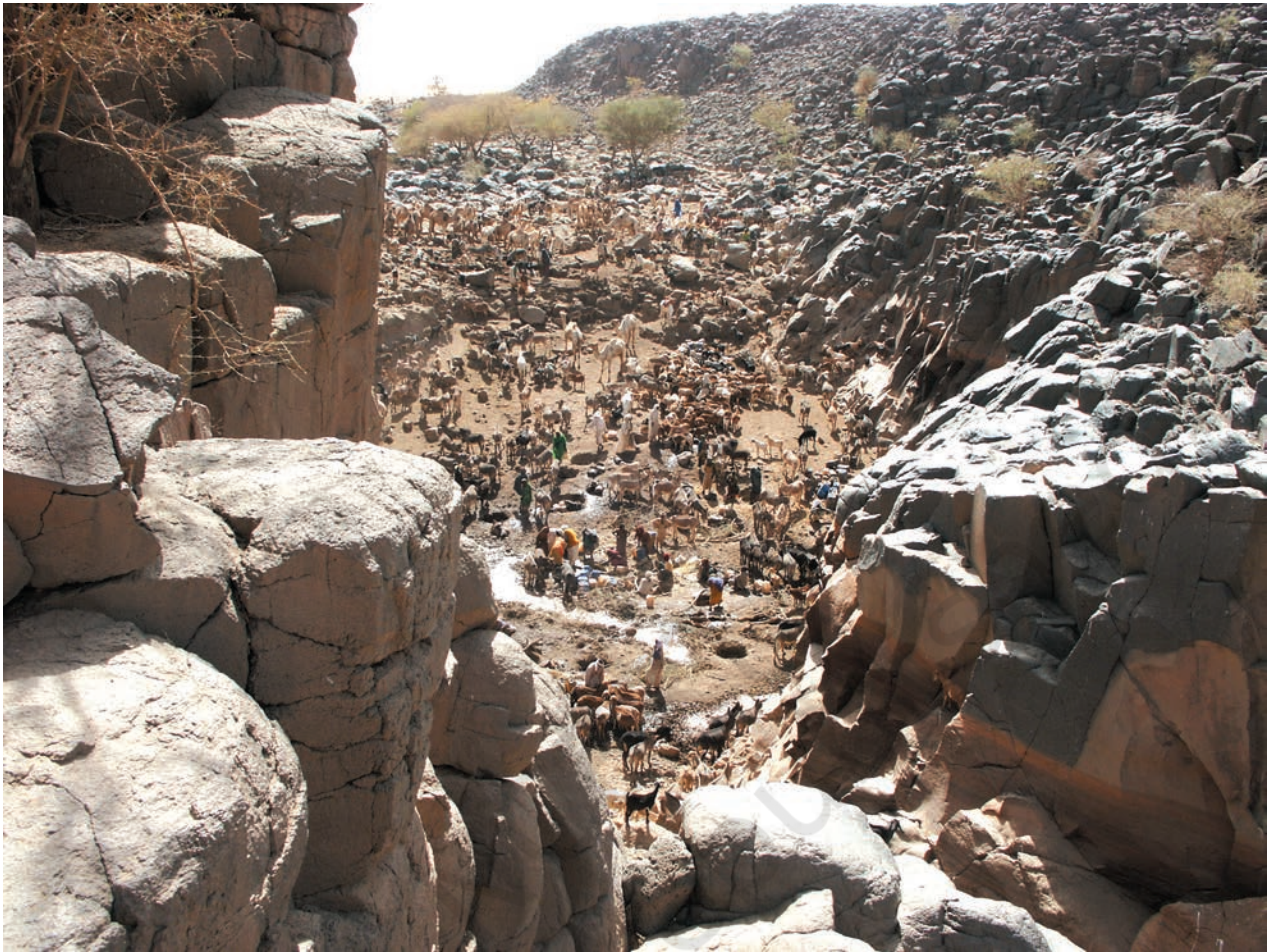
One of the biggest catastrophes in Africa in the 1970s, a drought turned the best cropland in five countries into cracked and barren earth. In fact, the term environmental refugees came into popular vocabulary after this. Many had to flee their homelands as agriculture was no longer possible.

basis of vague scientific evidence and time frames. In that sense the discovery of the ozone hole over the Antarctic in the mid-1980s revealed the opportunity as well as dangers inherent in tackling global environmental problems.